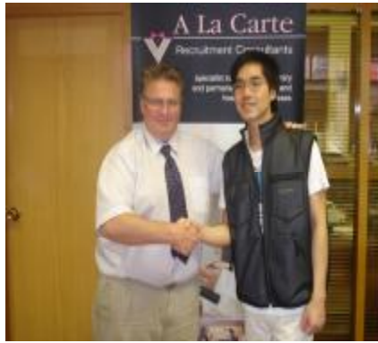
September 2009 Chung Mo