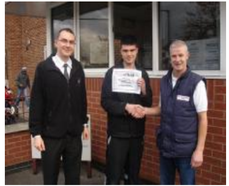
October 2009 Kevin Powell